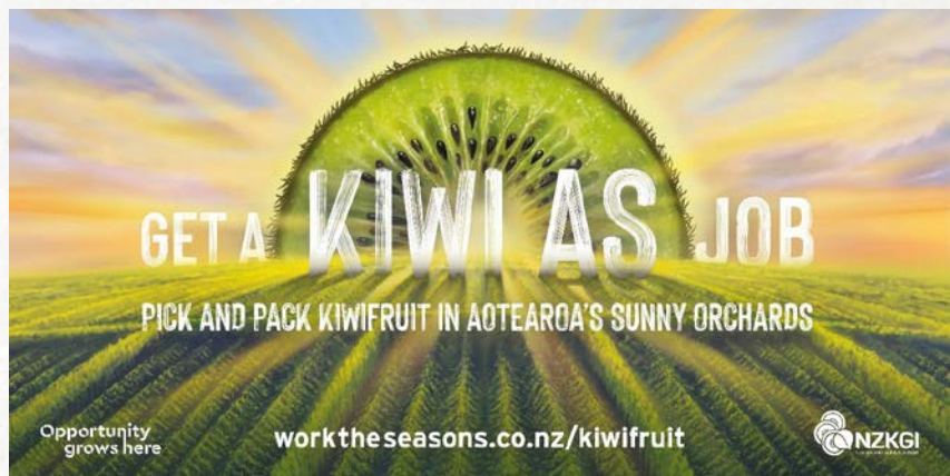
The communications portfolio worked collaboratively with the Ministry for Primary industries' Opportunity Grows Here campaign to attract seasonal labour to kiwifruit jobs across New Zealand.

NZKGI continues to retain a prominent presence in the media on issues surrounding New Zealand's kiwifruit industry. Over the reporting period, the Communications Portfolio has managed a plethora of kiwifruit topics, with the most prominent including COVID-19, Hi-Cane and seasonal labour. In addition to such topics, NZKGI has proactively released good news stories in regional publications which illustrate the positive side of the kiwifruit industry. These stories are also available on the NZKGI website.