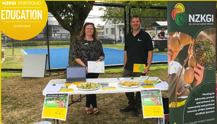
The NZKGI team promoting seasonal jobs at the Toi Ohomai Institute of Technology.

The practical component of the competition will take place during the day, with Mount Maunganui College providing the venue. The Gala Dinner will be a more intimate affair in the Zespri building. The highlight of the evening event is always the speech component of the competition. The eight competitors prepare a three-minute speech on a topic set by the committee and are judged by a panel of invited dignitaries.