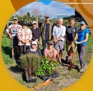
NZKGI's Volunteer day on an orchard in the Wai Kokopu catchment.

The Environmental & Policy portfolio has had a very busy year responding to a large volume of government consultations, navigating through the water strategy and looking at ways we can help our communities.