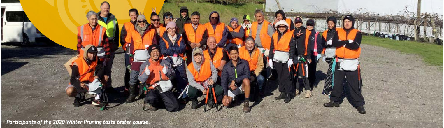
Participants of the 2020 Winter Pruning taste tester course.

With the advent of COVID-19 in 2020, the Education Portfolio became more involved in education and training to directly support new-comers into the kiwifruit industry rather than its usual focus on school students choosing careers. Planned events being disrupted on short notice by changes in COVID-19 alert levels was an unfortunate reality throughout the year.