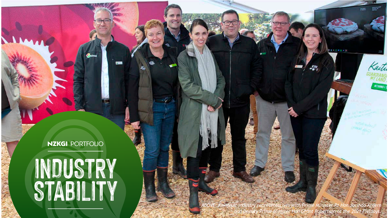
ABOVE: Kiwifruit industry representatives with Prime Minister Rt Hon Jacinda Ardern and Deputy Prime Minister Hon Grant Robertson at the 2021 Fieldays.

INDUSTRY STABILITY | PERFORMANCE & SUPPLY | COMMUNICATIONS EDUCATION | LABOUR | ENVIRONMENTAL & POLICY ORGANISATIONAL MANAGEMENT