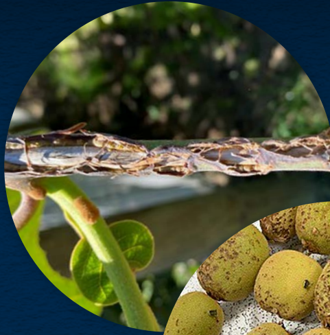
Damaged vines and fruit from the Boxing Day adverse event in Motueka resulting in a hail policy review.