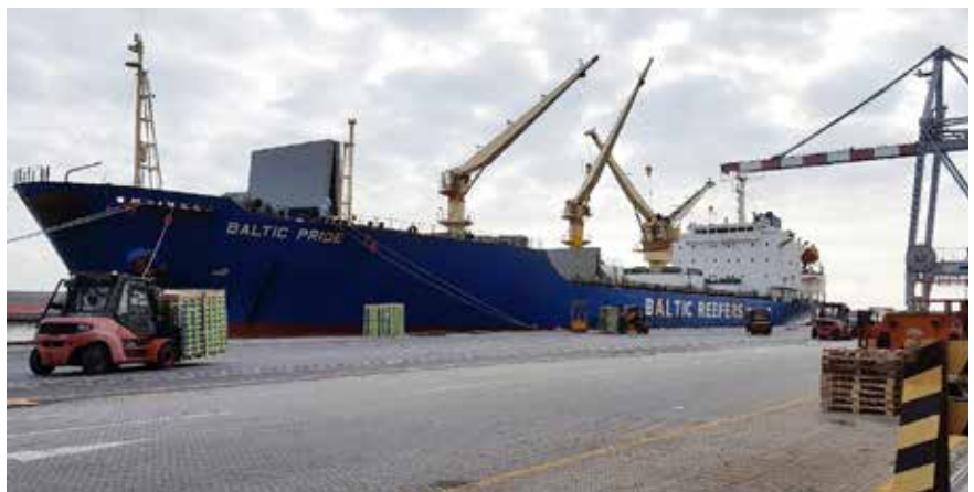
Right: Pallets being lowered and stowed into the hold of a reefer ship