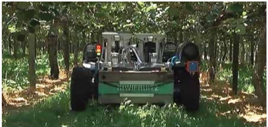
Right: Robotics Plus kiwifruit harvesting autonomous vehicle