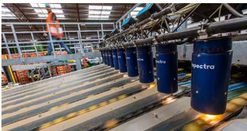
Right: NIR grading machine

The grading machine then accepts or rejects the fruit and the ones that are accepted are then bumped off the line at the right time to be packed in trays with fruit of the same size and quality. This was all once undertaken by individuals handling every piece of fruit and the use of this technology has reduced the number of manual graders on an average shift from 20 down to 3.